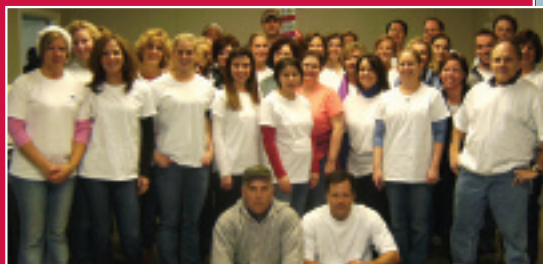
The Gallagher Benefits team spent the day on our campus cleaning our kitchen, sorting donations, and distributing holiday gifts.

To view photos of all of our volunteers, please visit our website at www.northernhome.org .