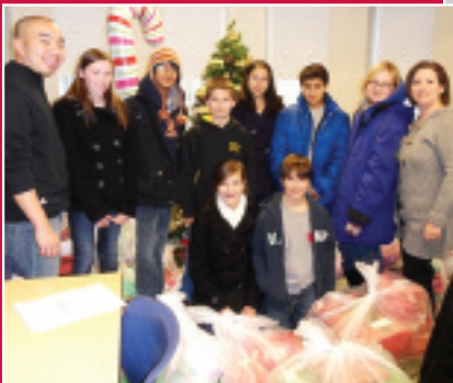
Thank you Timberlane Middle School students for nearly 130 holiday gifts for our children!