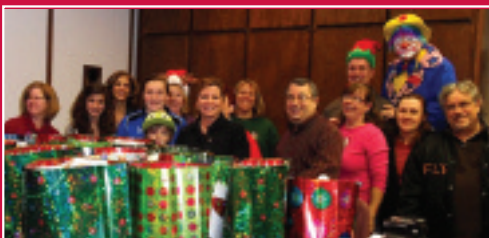
Thank you PAIAPP for the wonderful holiday party for our kids!