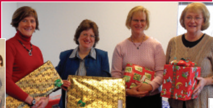
Thank you to the entire Unisys team for collecting over 150 gifts for our children this holiday season!