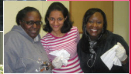
U-Store It volunteers spent the day on our campus cleaning, prepping and painting new offices for our development team.