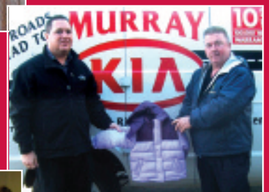
Thank you to Murray Kia for the generous donation of coats for our children.