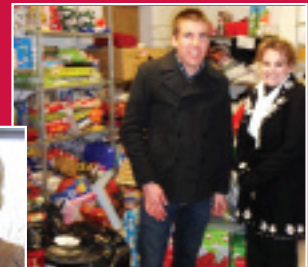
Thank you to Wawa employees who collected over 75 holiday gifts for our children!